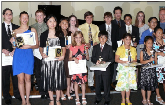
Competition winners pose with their awards.

On May 16th & 17th, local students aged 6 through 18 participated in the 8 th annual FGCU/ Steinway Piano Competition, co-sponsored by FGCU's Bower School